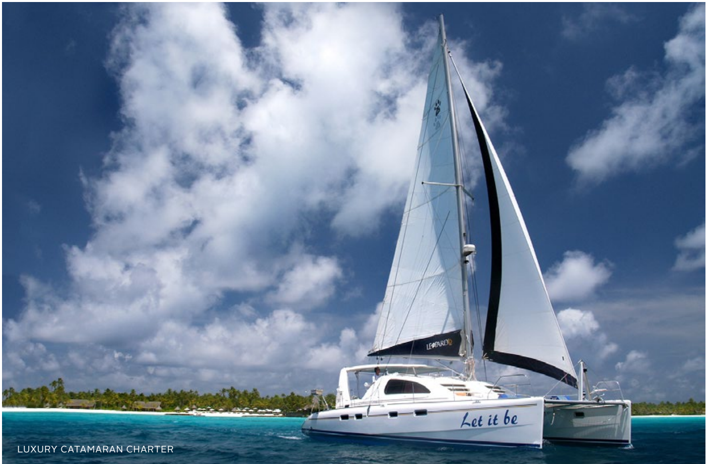
LUXURY CATAMARAN CHARTER