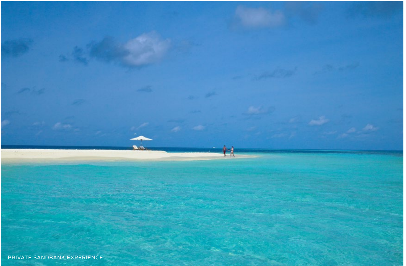
PRIVATE SANDBANK EXPERIENCE